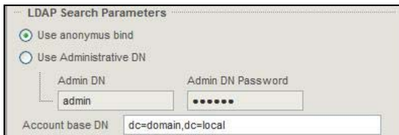
Figure no. 2

Next, the authentication method has to be changed in the AXIGEN configuration. Note that this setting is global and affect all services that interact with account login processes: